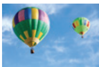
Hot Air Ballooning