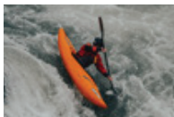
White Water Rafting